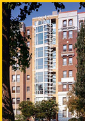
THE STUDIO THEATRE PAGE 273