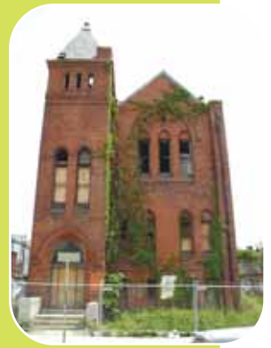
The restored church and modern addition will house 44 condominiums.