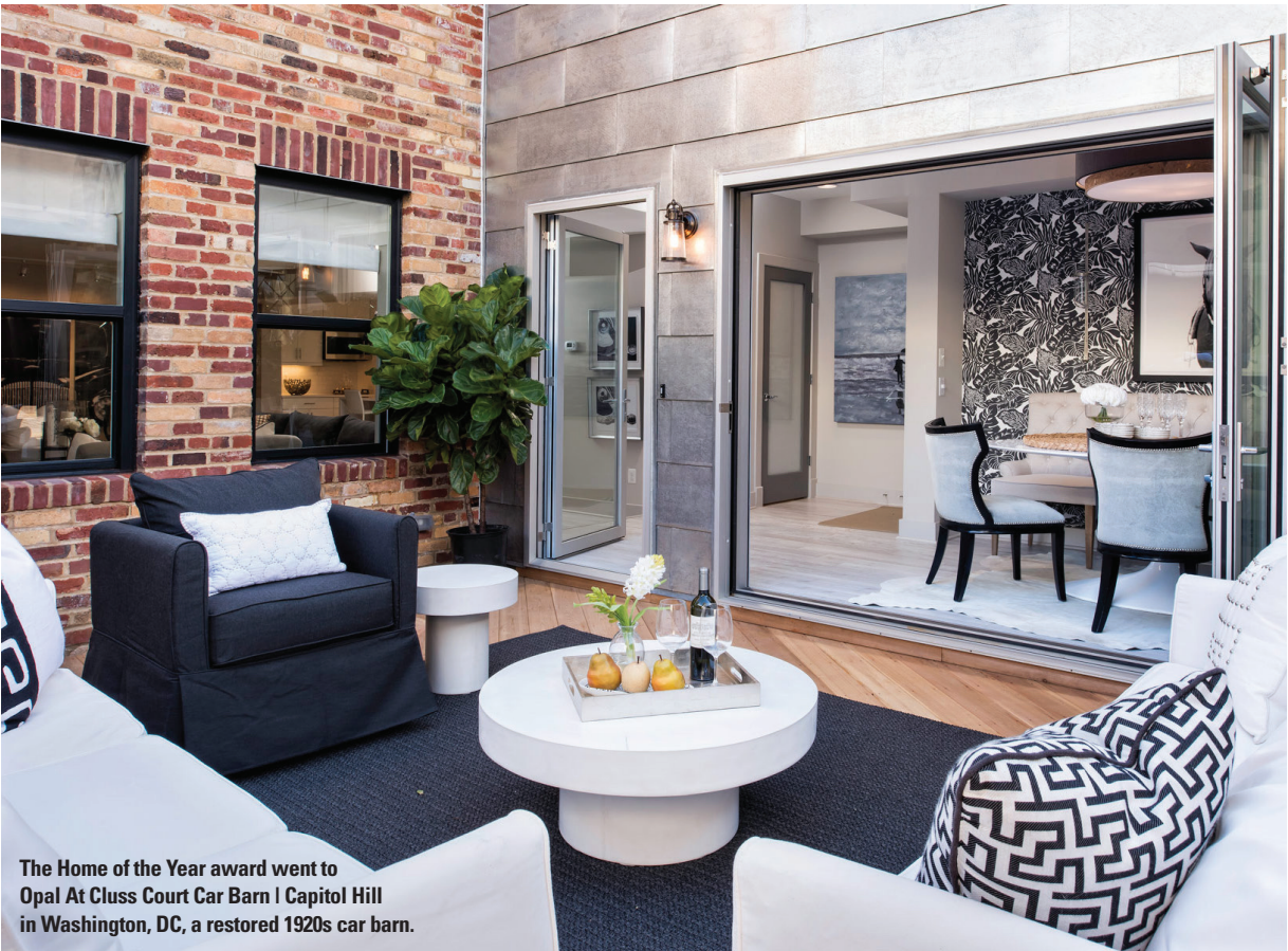
The Home of the Year award went to Opal At Cluss Court Car Barn | Capitol Hill in Washington, DC, a restored 1920s car barn.