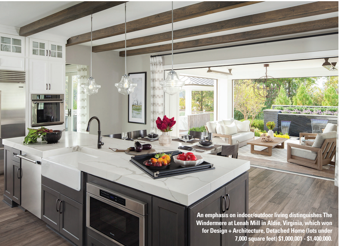
An emphasis on indoor/outdoor living distinguishes The Windermere at Lenah Mill in Aldie, Virginia, which won for Design + Architecture, Detached Home (lots under 7,000 square feet) $1,000,001 - $1,400,000.