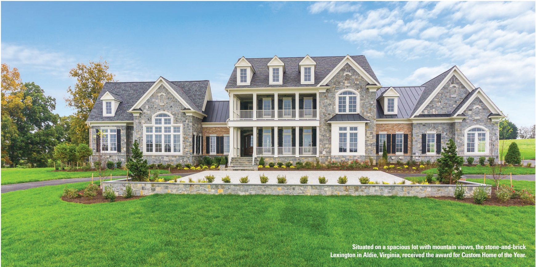
Situated on a spacious lot with mountain views, the stone-and-brick Lexington in Aldie, Virginia, received the award for Custom Home of the Year.