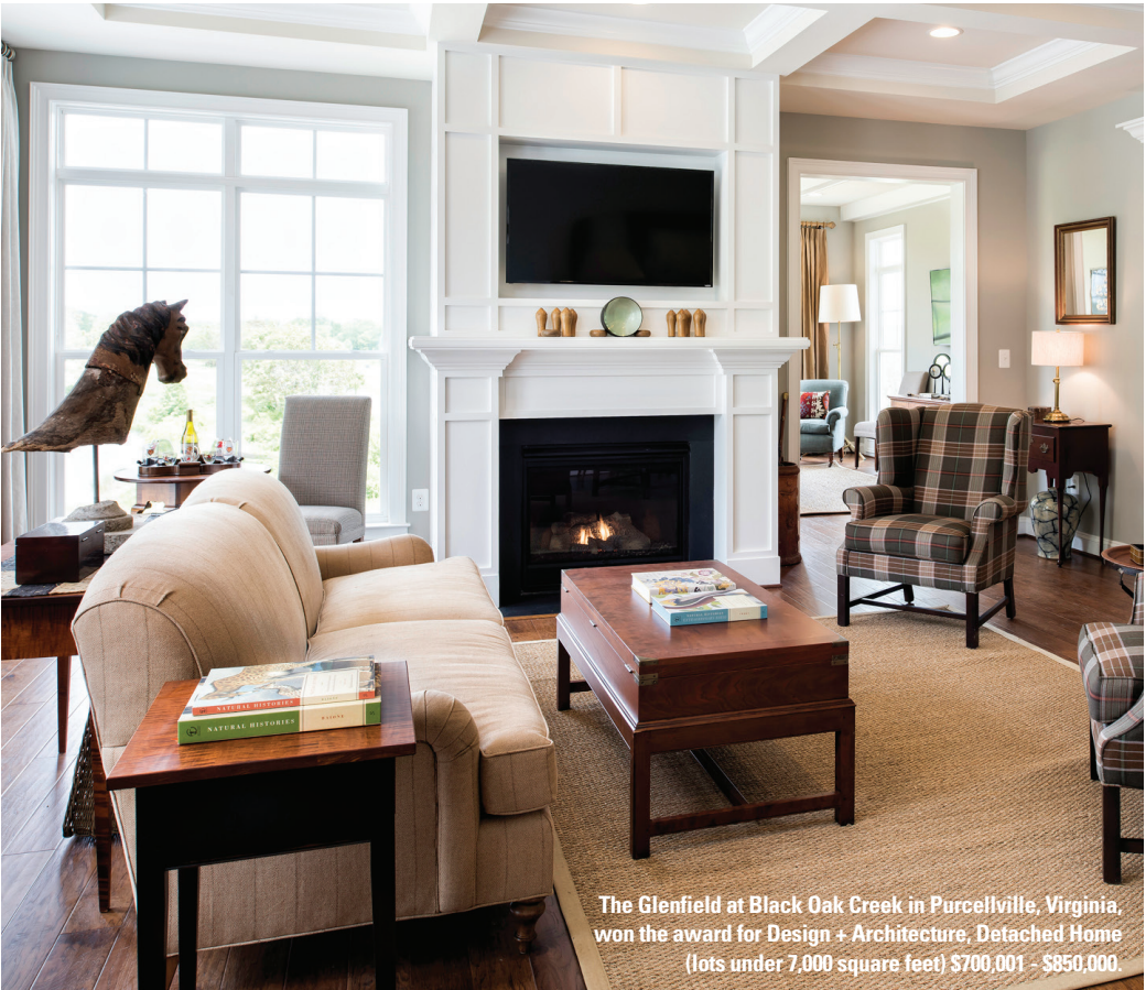
The Glenfield at Black Oak Creek in Purcellville, Virginia, won the award for Design + Architecture, Detached Home (lots under 7,000 square feet) $700,001 - $850,000.