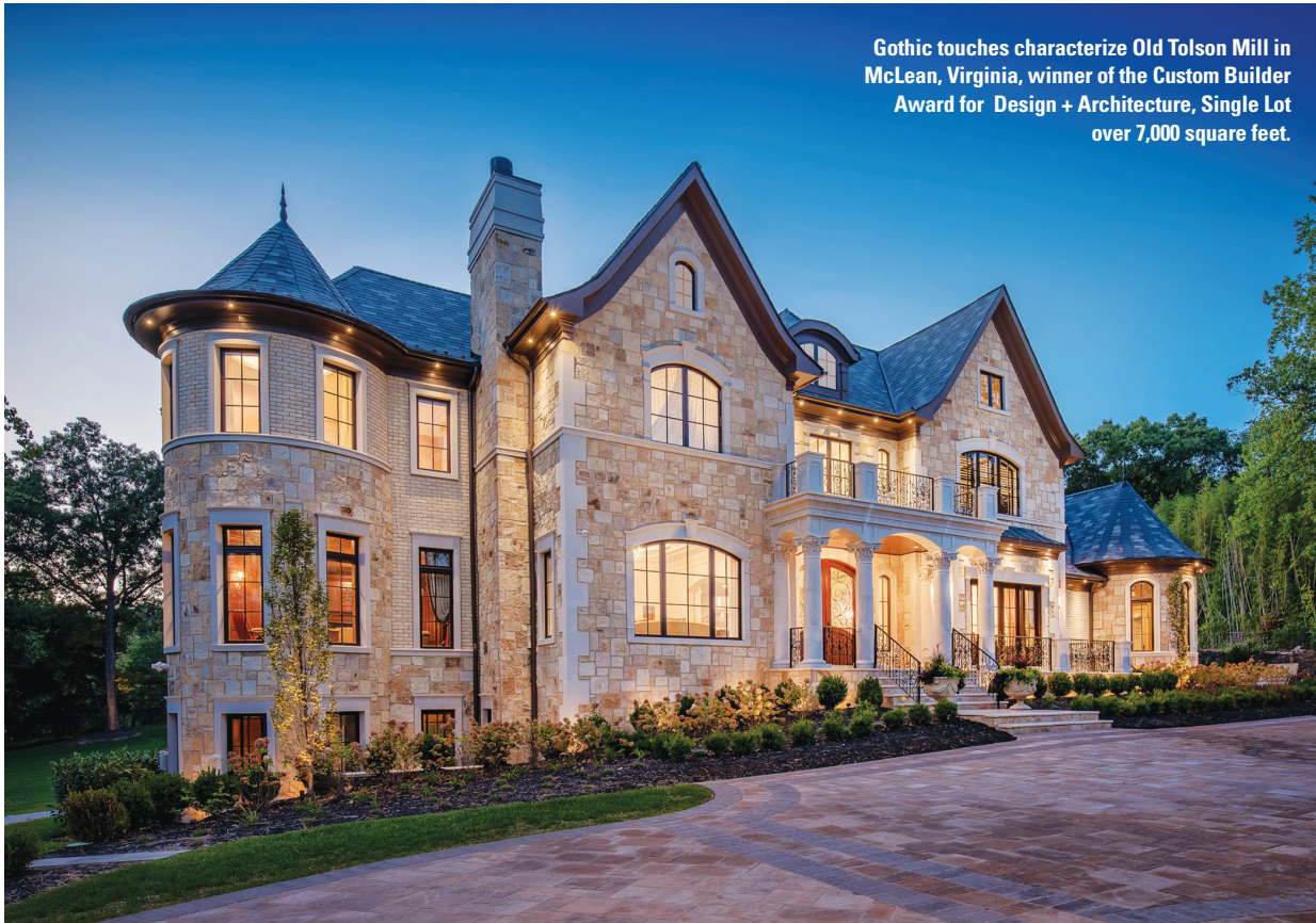
Gothic touches characterize Old Tolson Mill in McLean, Virginia, winner of the Custom Builder Award for Design + Architecture, Single Lot over 7,000 square feet.