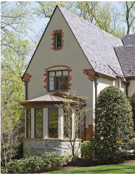
Located in Chevy Chase, Maryland, Kennedy Drive won the Custom Builder Award for Design + Architecture, Renovations or Additions over $1,000,000.

Each year, a panel of building-industry professionals chooses nominees for the Great American Living Awards. Sponsored by the Northern Virginia Building Industry Association, the Washington Metropolitan Sales & Marketing Council and the Maryland Building Industry Association, the GALA Awards—held last fall at the Hilton McLean Tysons Corner—honor excellence in new home architecture, interior design, sales and marketing in the Mid-Atlantic region. The 2018 entries filled 45 categories; those pertaining to architecture and design included single- and multi-family homes, townhomes and condominiums, and custom-home and remodeling projects. On the following pages, we spotlight the Grand award winners in custom building, residential architecture and design.