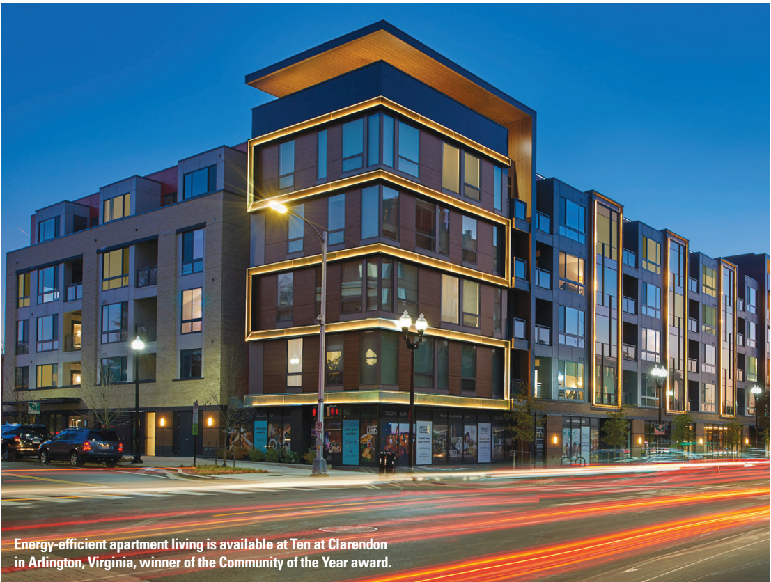
Energy-efficient apartment living is available at Ten at Clarendon in Arlington, Virginia, winner of the Community of the Year award.