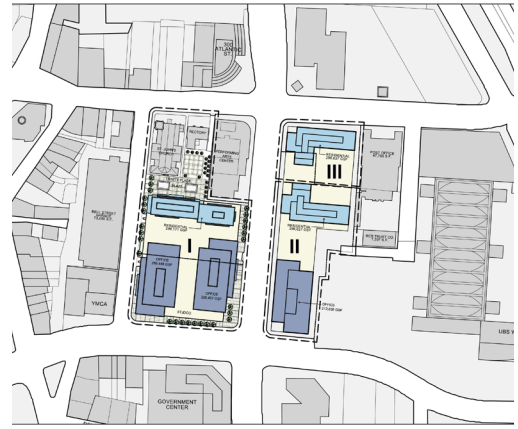
Tresser Square Stamford, CT 2,000,000 square feet