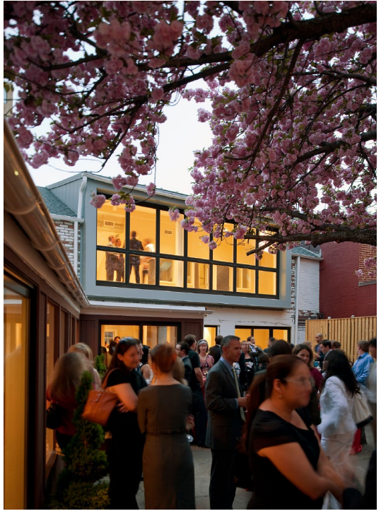
1730 Massachusetts Avenue Washington, DC