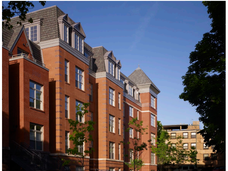
2nd & V

Parker Flats at Gage School Washington, DC