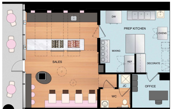
Hello Cupcake Washington, DC