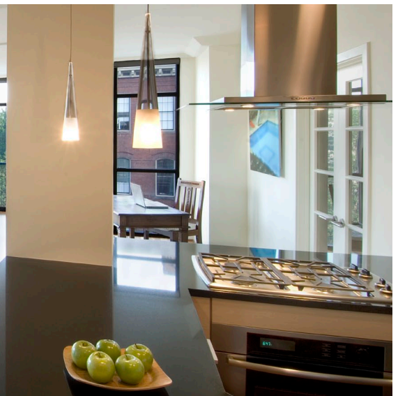
Q14 Condominiums Washington, DC