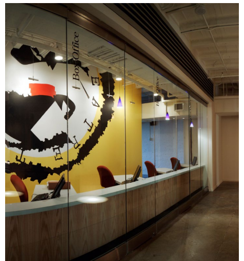
The Studio Theatre Washington, DC