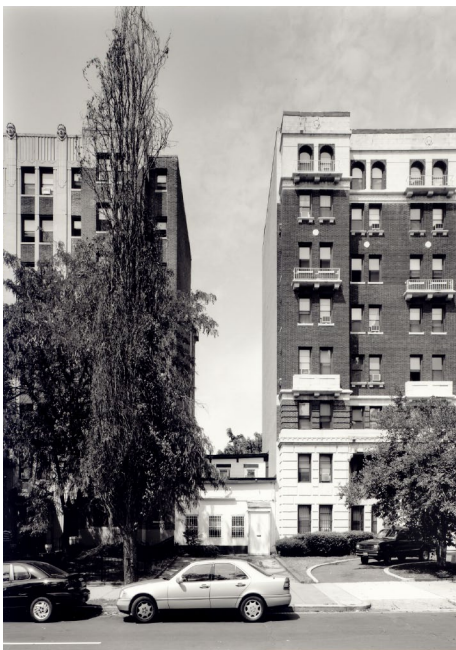
The Tapies Condominium Washington, DC 10,000 square feet

Multi-Family Residential Duplex Residential Units Urban Infill