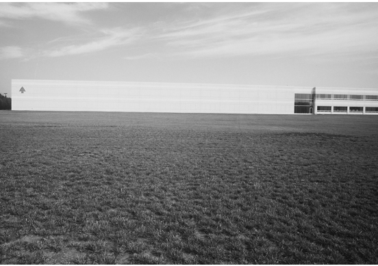
Before - Southeast Facade

America Online Headquarters Creative Center 1 Dulles, VA 183,000 square feet