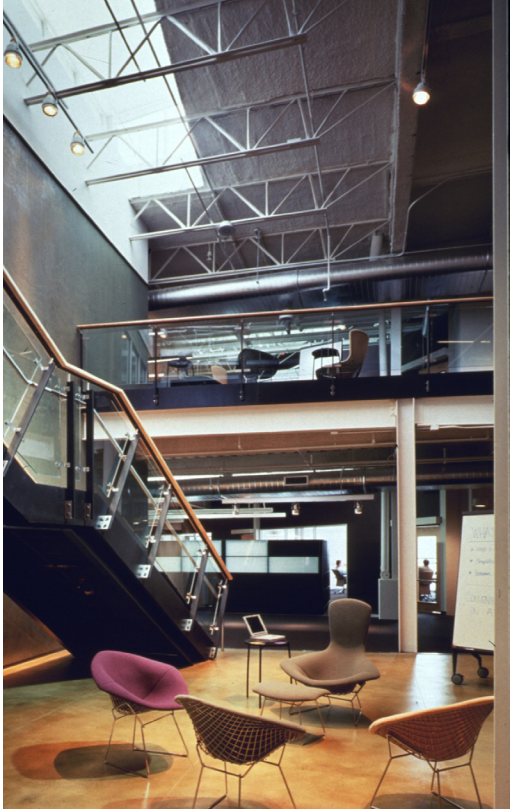
America Online Headquarters - Creative Center 1 Dulles, VA