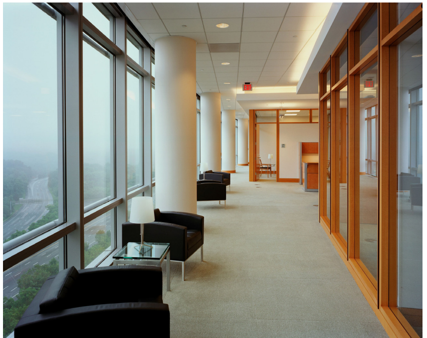
Capital One Headquarters McLean, VA