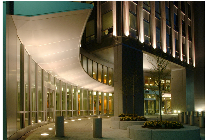
Capital One Headquarters McLean, VA 580,000 square feet

Corporate Headquarters Commercial Office Underground Parking Multi-building Complex LEED - Silver