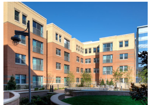
The Jordan Arlington, VA