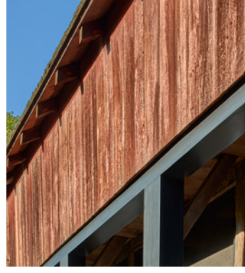
Rappahannock County, VA