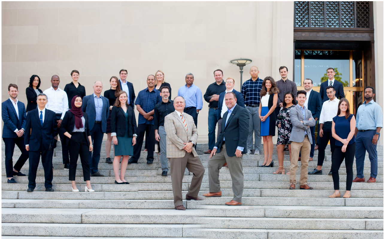
Bonstra | Haresign ARCHITECTS, 2019