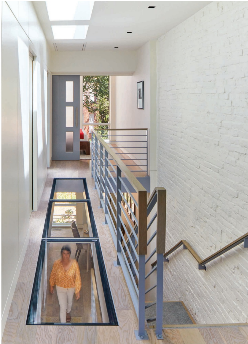
Staircase with glass-floored walkway.