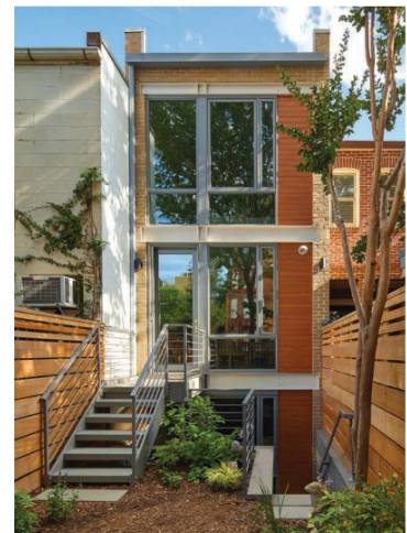
New rear façade.